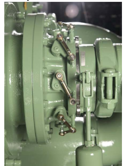
Figure 3: Side-view of mounted IGV showing the yoke assembly and actuator.