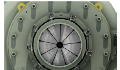
Figure 2: Front-view of IGV in fully-closed position.